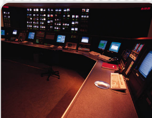
HNS Response Centre

Training Knowledge useful abilities. backbone of co quired for a tr