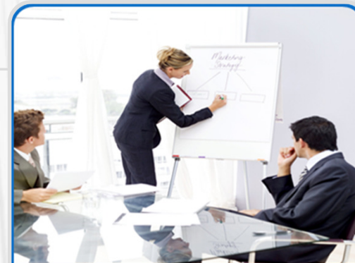
SOP for Joint HNS Spill Combat